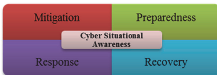
Fig. 1. Cyber Situational Awareness for Emergency Management.

Since all EM tasks fall within the following categories: mitigation, preparedness, response and recovery (Dudenhoeffer et al., 2007), each is impacted by cyber situational awareness as listed in figure 1.